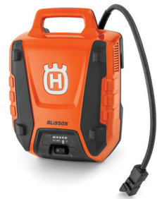
BLI950X BACKPACK BATTERY MODULE 579 82 22-01