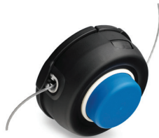
T35X TAP-N-GO™ TRIMMER HEAD (BALL BEARING) 578 44 65-01