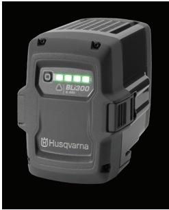
BATTERY BLI300 967 07 19-01