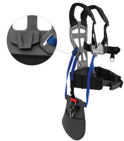
HARNESS BALANCE XB 597 46 93-01