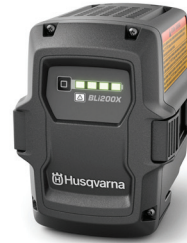
BLI200X BATTERY 970 44 89-01