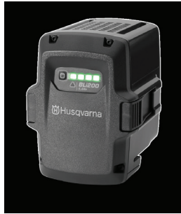
BLI200 BATTERY 967 09 19-01