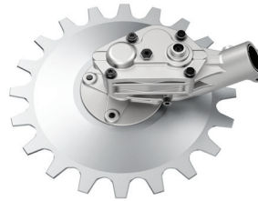
HUSQVARNA WEED SCISSOR GEAR ATTACHMENT RA-V 967 90 86-01