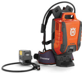
BLI950X BACKPACK BATTERY 967 09 32-01